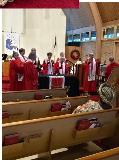
Ringalings Handbell Choir