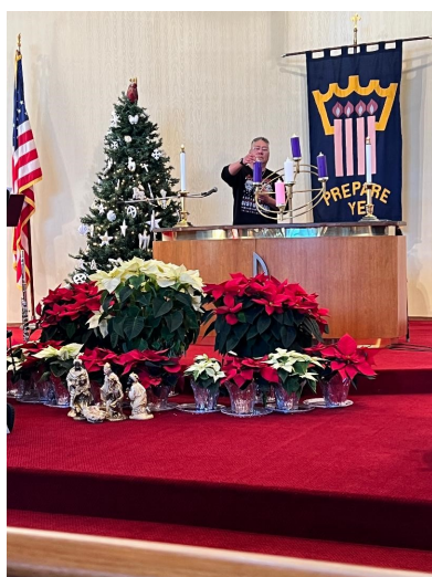
Lighting the candle of Love