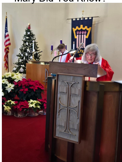
Lighting the candle of Joy